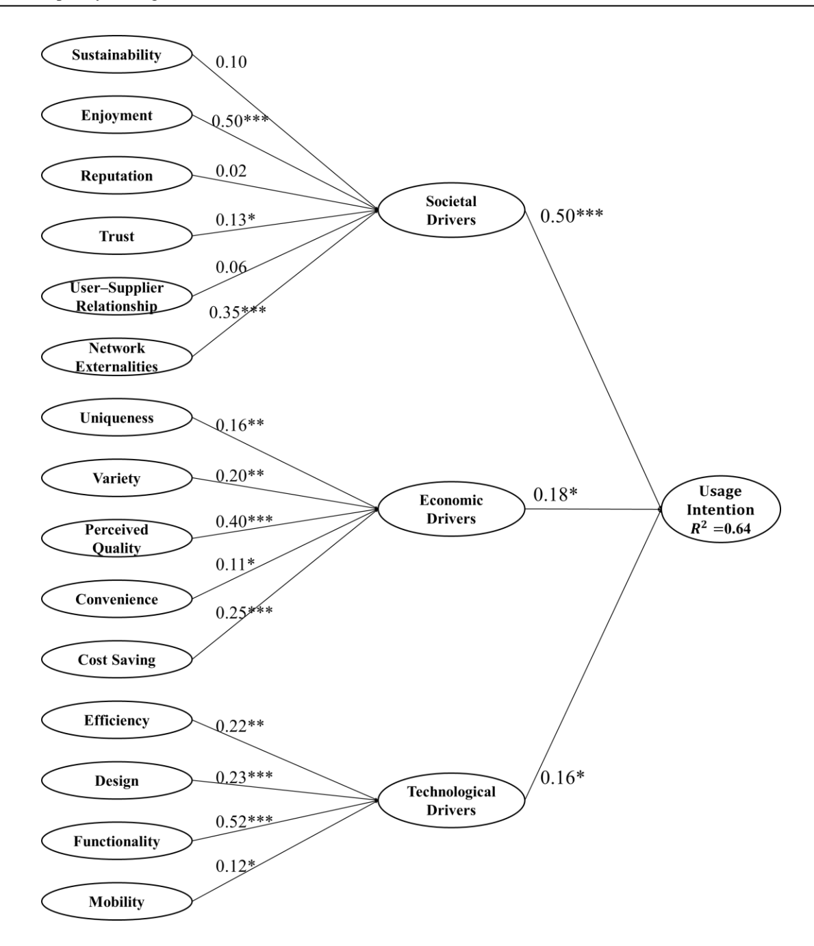
Figure 2 Results Model

The results revealed the statistically significant relationship between sharing economy drivers and consumers' usage intentions. When the societal drivers in the sharing economy platform were higher, users' usage intentions were enhanced ( \beta s=0.50, t=10.08, p<0.001). Thus, H1 was supported. When the economic drivers in the sharing economy platform was higher, users' usage intentions were enhanced ( \beta e=0.18, t=2.39, p<0.05). Thus, H2 was supported. When the technological drivers in the sharing economy platform was higher, users' usage intentions were enhanced ( \beta t=0.16, t=2.35, p<0.05). Hence H3 was supported.